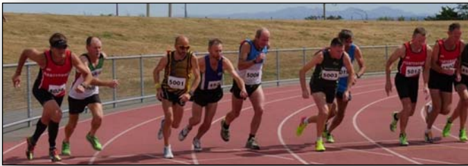
Start of the M45-50 1500m final at the NZMA Championships in Nelson.