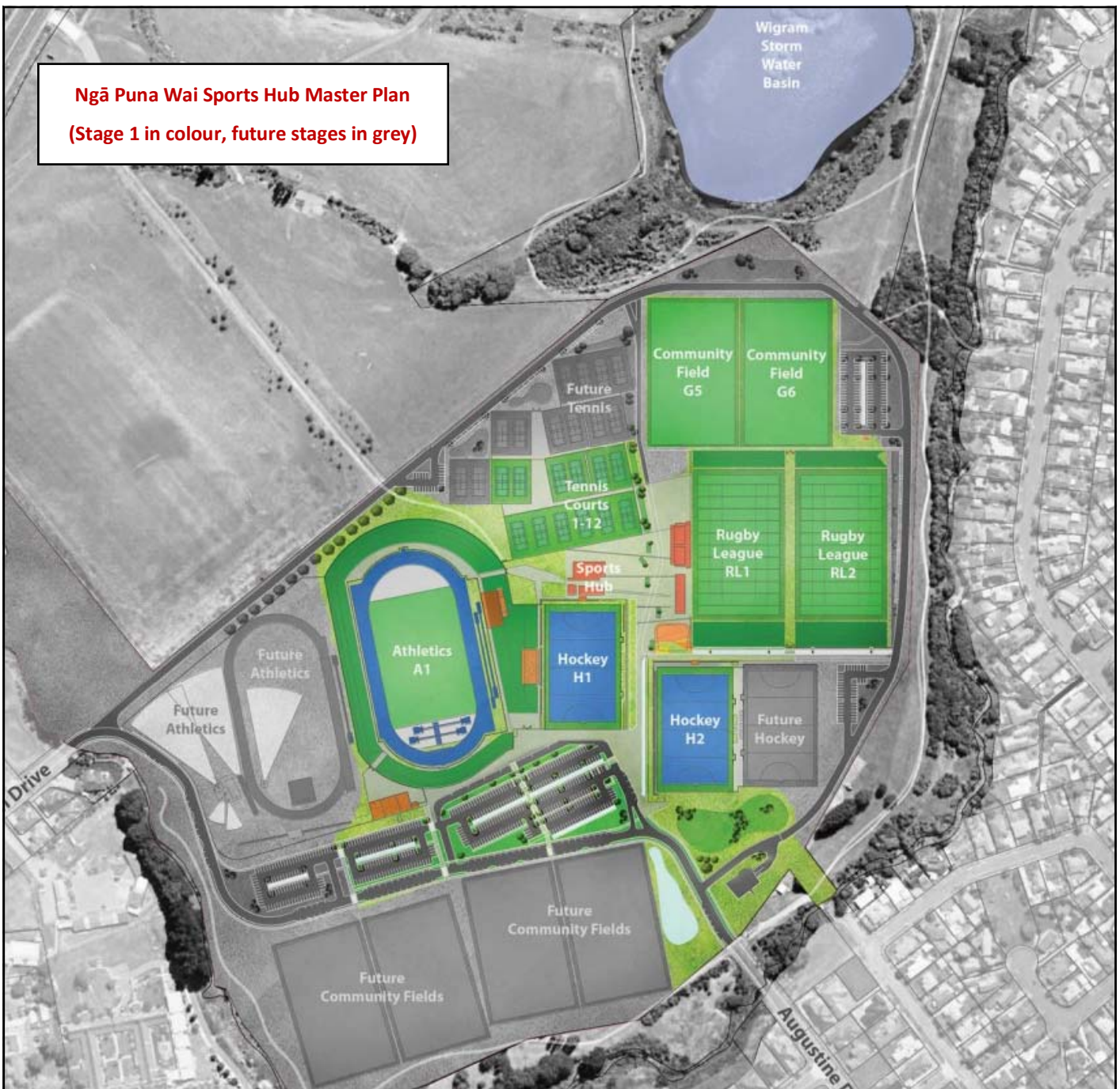
Ngā Puna Wai Sports Hub Master Plan (Stage 1 in colour, future stages in grey)

March 2nd - 4th 2018 (TBC) Venue: Whangarei